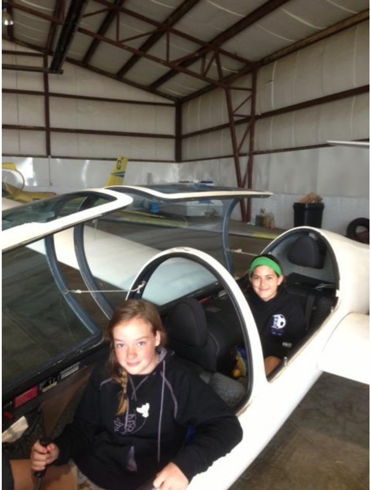
Future Glider Pilots